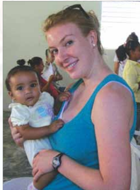
Nursing student at lung health clinic

Lung diseases including asthma, COPD, respiratory infections, and tuberculosis are major health issues in the Dominican Republic. Environmental conditions (e.g.: unpaved roads, high levels of particulate matter, high humidity and crowded living conditions in poorer barrios) and malnutrition contribute to higher rates of respiratory problems. For example, children are often exposed to irritants from kerosene, cooking fires and second-hand cigarette smoke. Inadequate hygiene practices are also a risk factor, leading to the spread of respiratory infections.