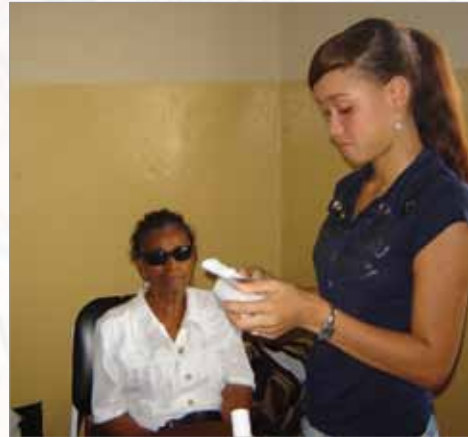
Spirometer in use by medical student