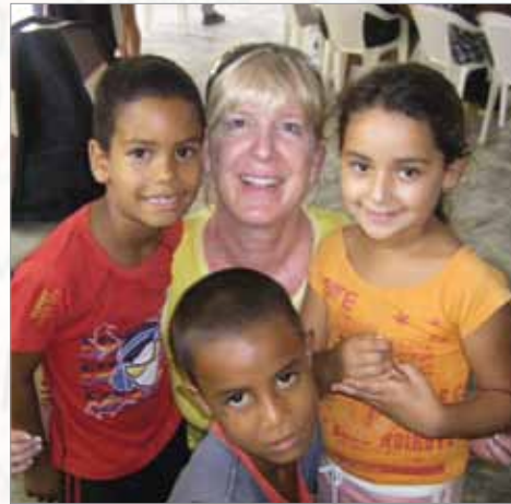
CCAP colleague with young patients

Since 1991 the Calgary COPD & Asthma Program (CCAP) has been a leader in promoting and initiating quality lung health programs both locally and nationally. Its activities are now extending outward to address the needs of under-served communities. CCAP respiratory educators and physicians are using their experience and skills to improve the lung health of those living in poverty in the Dominican Republic.